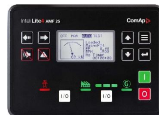
IntelLite 4 AMF 25