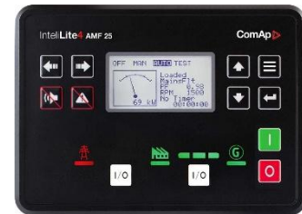
IntelLite 4 AMF 25