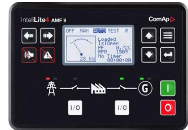
IntelliLite 4 AMF 9