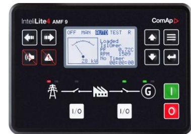
IntelliLite 4 AMF 9